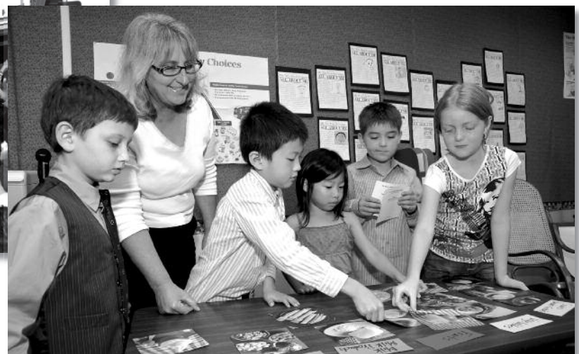
Dairy Council's Mobile Dairy Classroom unit (above); Students using a Dairy Council program at a California school (right).